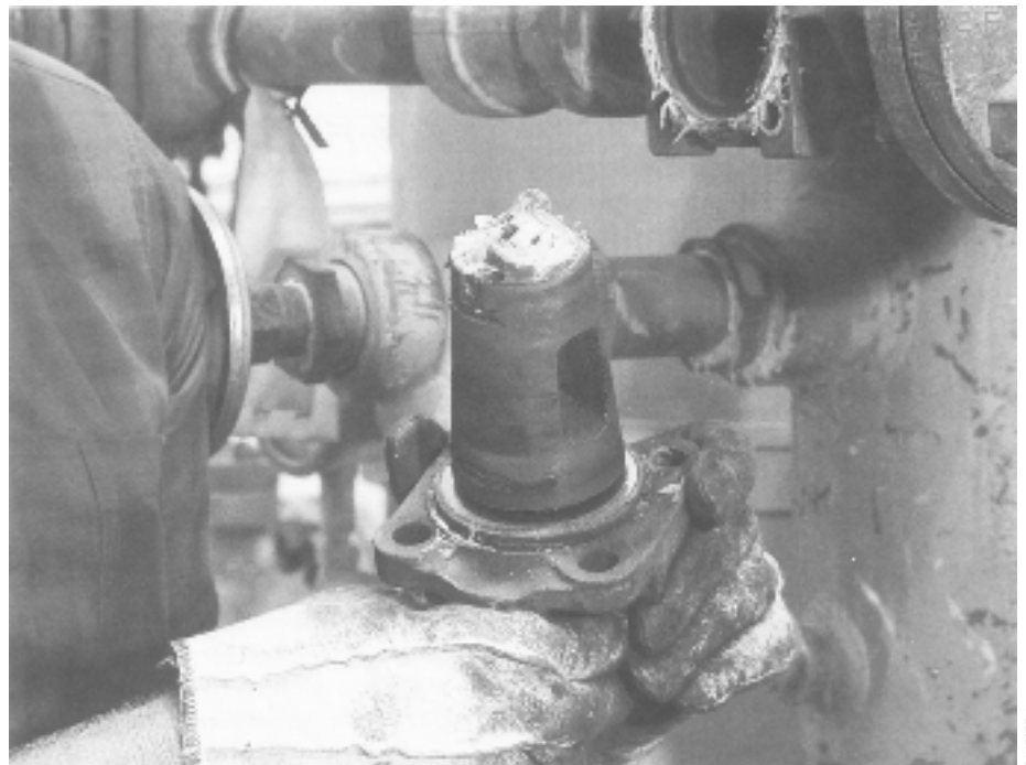
Valves protected by MOLYKOTE 3452 Chemical Resistant Valve Lubricant show no evidence of corrosion or degradation of lubricant.